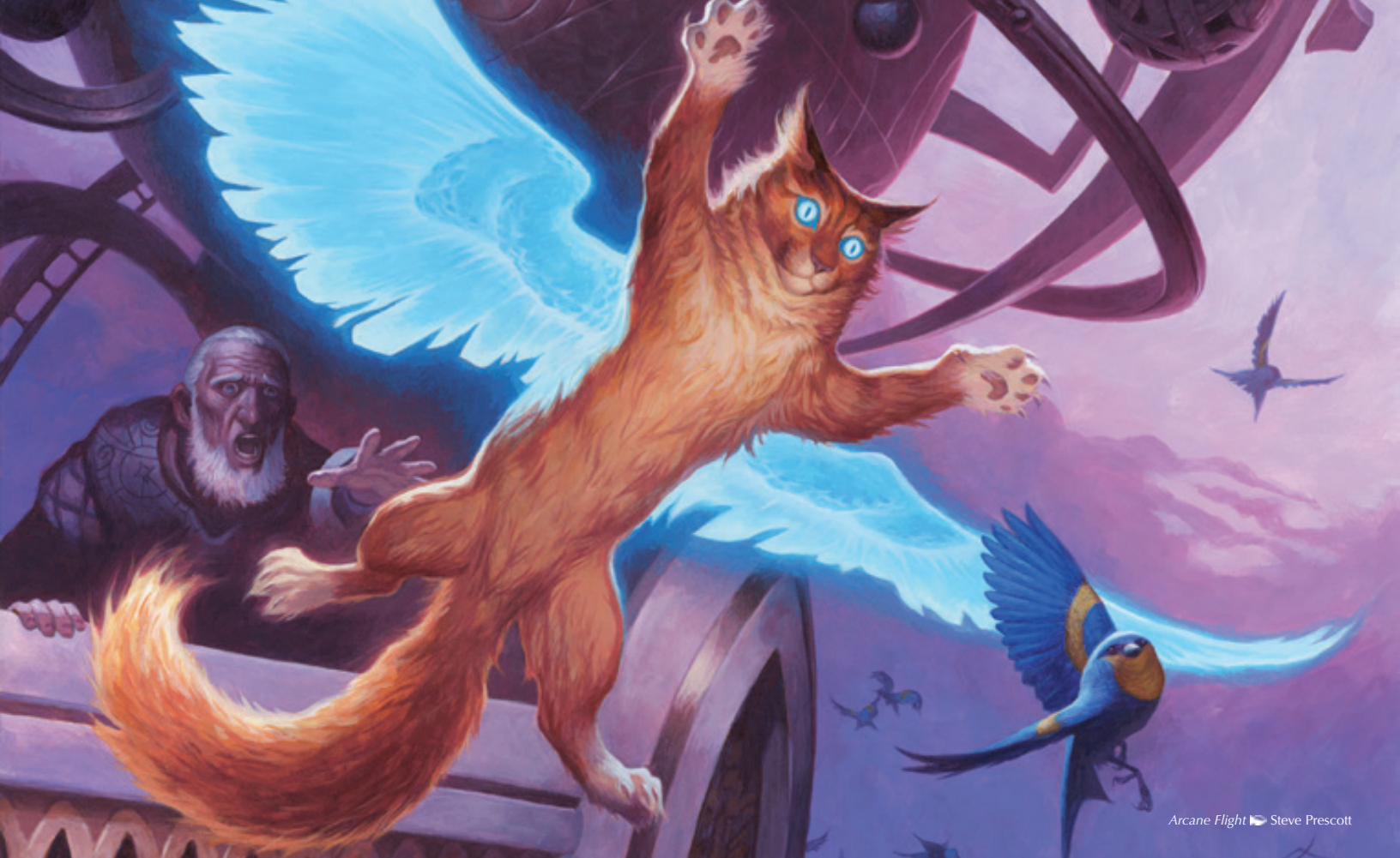
Arcane Flight by Steve Prescott